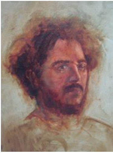
Self Portrait, 2007